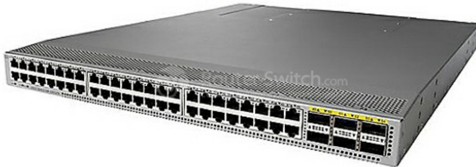
Table 1 shows the Quick Specs.

Figure 1 shows the appearance of the N9K-C9372TX-E.