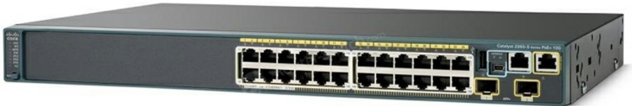
Table 1 shows the Quick Spec of the WS-C2960S-24TD-L.

Figure 1 shows the appearance of the WS-C2960S-24TD-L.