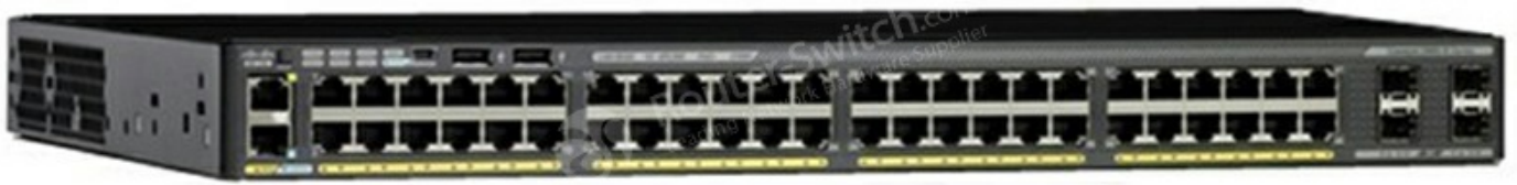
Table 1. Cisco WS-C2960X-48TS-L Specs.

Figure 1 shows the front view of the Cisco 2960X-48TS-L switch.