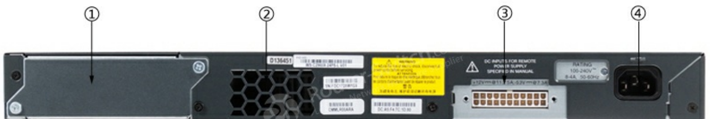
Figure 3 shows the back panel of the Cisco 2960X-48TS-L switch.

The Switch LEDs include SYST, STAT, SPEED, RPS, MAST, and STACK LEDs.