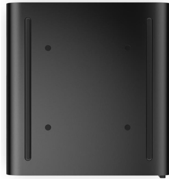
HP Z2 G9 Mini Workstation Desktop PC, bottom view

Removable VESA cap for access to integrated VESA mounting holes