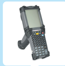
Data terminals & PDA