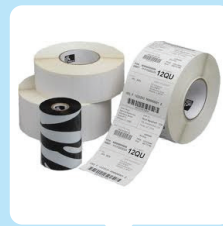
Consumables (labels, ribbons, PVC cards)