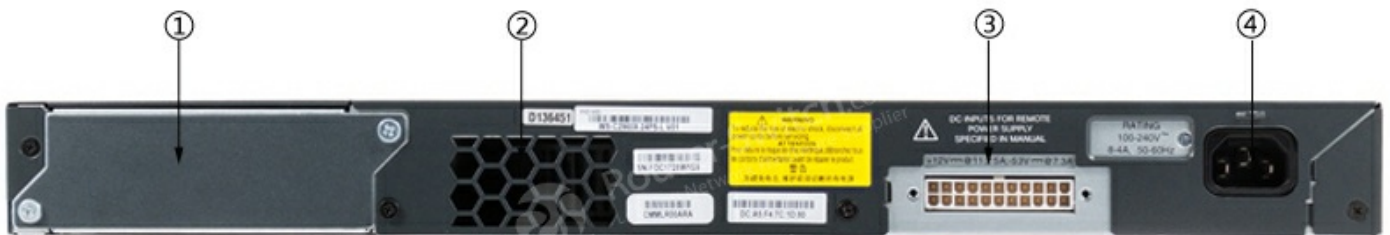
Figure 3 shows the back panel of WS-C2960X-48TS-LL.

The Switch LEDs include SYST, STAT, SPEED, RPS, MAST, and STACK LEDs.