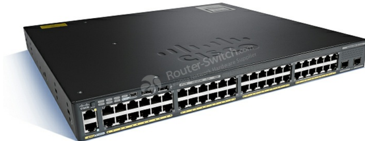
Table 1, WS-C2960X-48TS-LL Specs.

Figure 1 shows the appearance of WS-C2960X-48TS-LL.