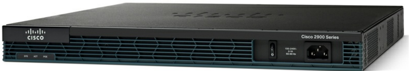
Table 1 shows the Quick Specs of the CISCO2901/k9.

Figure 1 shows the appearance of the CISCO2901/k9.