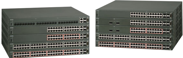
Ethernet Routing Switch 4500 Series

For businesses looking to bring together their major forms of communication — voice, video and data — onto a single infrastructure, the Ethernet Routing Switch 4500 Series delivers the functionality that makes converging these technologies simple.