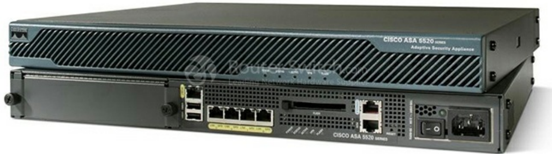
Table 1 shows the quick spec.

Figure 1 shows the appearance of ASA5520-BUN-K9.