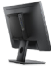
OPTIPLEX MICRO ALL-IN-ONE MOUNT FOR DELL E SERIES MONITORS

Small footprint mounting solution adapts to your environment, with cable management and monitor height adjustability, tilt, swivel and pivot functions.