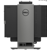
OPTIPLEX SMALL FORM FACTOR ALL-IN-ONE STAND (COMING SOON)

Minimize your footprint with this arm that offers easy installation and enhanced adjustability while keeping cables neatly hidden from view.