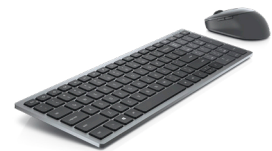
DELL PREMIER WIRELESS KEYBOARD AND MOUSE | KM7120W

See fine details and true-to-life color on this 27" QHD monitor in an innovative, stylishly thin design with USB-C connectivity.