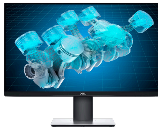
DELL ULTRASHARP 27 USB-C MONITOR | U2719DC

Reduce desk clutter with this adjustable mount that securely houses the A/C adapter, per the needs of the user.