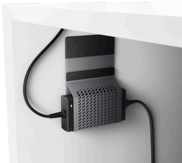
DELL A/C ADAPTER SLEEVE MOUNT

Securely house the Precision 3240 Compact and the monitor using a single or dual monitor arm on your desk with this mount.