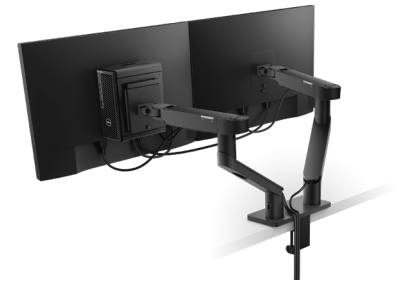
PRECISION COMPACT DUAL VESA MOUNT

The monitor stand mount allows the Precision 3240 Compact to be firmly mounted behind select stands and monitors, as shown above (mounted on back of P2720DC monitor).