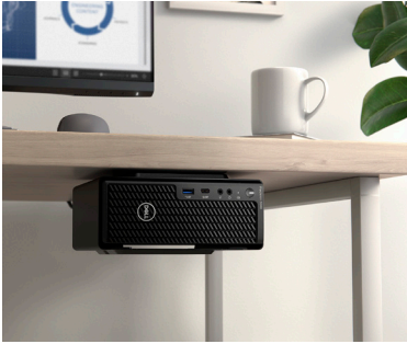
PRECISION COMPACT VESA MOUNT

Securely house the Precision 3240 Compact under your desk with this mount without losing easy access to the Precision's ports. Or securely mount it to the wall for added flexibility.