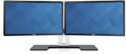
Dell Dual Monitor Stand