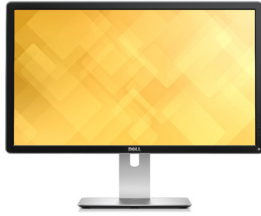
Dell 24 Ultra HD 4K Monitor | P2415Q