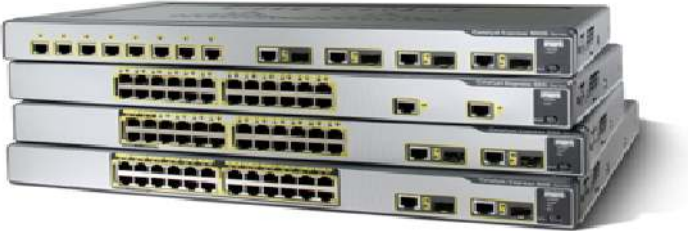
Figure 1. Cisco Catalyst Express 500 Series Switches

Figure 2 shows typical Cisco Catalyst Express 500 Series Switch deployment scenarios.