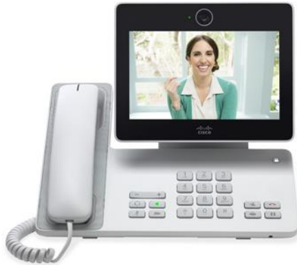
Figure 1. Cisco DX650