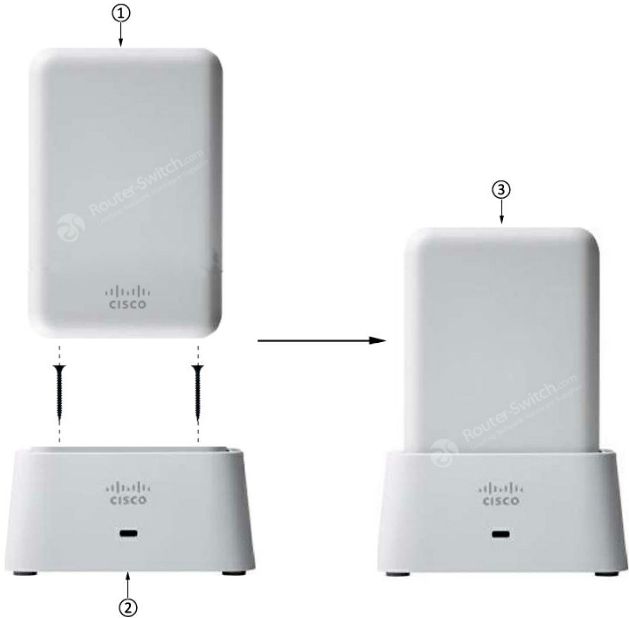
Figure 3. Mounting the AP in the Cradle.

· PSE / LAN port 1 provides 802.3af/at Power Sourcing Equipment (PSE) PoE-Out power on the LAN 1 Ethernet interface. With 802.3at input the PoE-Out is 6.95W (Class 2).With DC input the PoE-Out is 12.95W (Class 0).